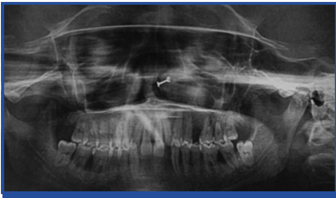
[Table/Fig-3]: Preoperative radiograph.